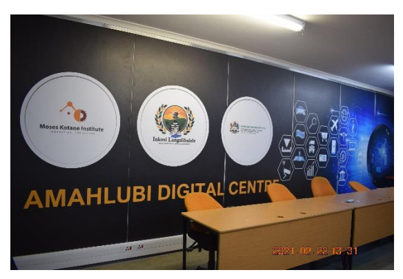
The Moses Kotane Institute AmaHlubi Digital Centre

Digital Centre's, electronic and manufacturing companies in KwaZulu-Natal are positioned within urban areas. Thus, the need to reposition Digital Centre's in townships and rural areas was pivotal for socio-economic development in peripheral areas. In 2019 the MKI embarked on a project aimed at building Digital Centres in rural and township areas. The following areas were identified as key strategic zones: Bergville, Kokstad, Mfolozi, Phongolo, Jozini, Mdoni, Amahlubi, Isthebe The Bergville, Mfoloz and and Umdoni. Amahlubi digital centres have been completed and set to start their digital training programmes next month.